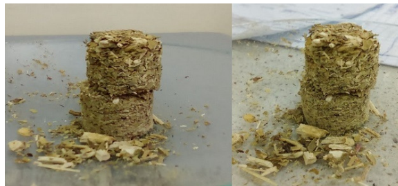
Fig. 1. Granules formed with 20MPa (left) and 40MPa (right)

The first tests reveal that the lowest values of compaction pressure (20 MPa and 40MPa) were too small to achieve granules, which would be strong enough to further testing, what is illustrated in Fig. 1. In this case, for all mixtures granulation was started from the pressure level 60MPa. The granules formed in a different pressure level are presented in Fig. 2.