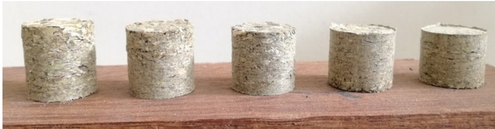
Fig. 2. Granules formed in (from left) 60, 80, 100, 120 and 140 MPa

Grain size distribution, presented in Table 1, shows that the selected brands are significantly different in fractionation. In mixtures I and IV bigger particles can be found (with diameter higher than 3.15 mm). All brands contain high amounts of fine particles, below 1mm (aprox. 40 %), what seems to be typical for this material.